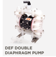
DEF DOUBLE DIAPHRAGM PUMP