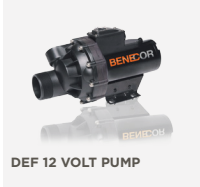
DEF 12 VOLT PUMP