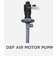
DEF AIR MOTOR PUMP