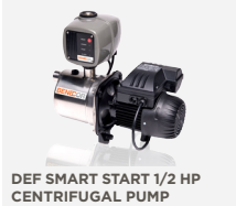
DEF SMART START 1/2 HP CENTRIFUGAL PUMP