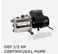
DEF 1/2 HP CENTRIFUGAL PUMP